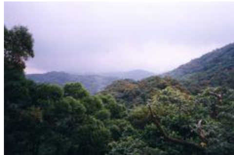
Terrain of the mountains in the area of OKA Camp.

In mid-August Michael made a further trip up into the mountains north of Taipei City in search of the elusive OKA Camp. Altogether, two separate days were spent looking for more clues to its location.