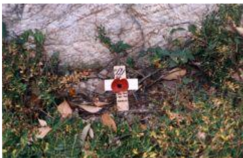
The Poppy Cross in the garden at Toroku Camp

After taking some photographs the team laid a poppy cross in the garden in front of the school, and paused to remember the men who had been interned there. Now at last they would not be forgotten!