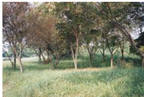
"Yasume Park" - unchanged after 55 years!

From a drawing of the camp that Michael had been given by one of the POWs, the layout of the former camp was easily recognized. The large grassy knoll and the spindly trees atop it seemed to come to life right out of the drawing. They also saw the place where the former camp hospital had been, along with the isolation huts for diphtheria and TB. They took a lot of photos of the area and then left the base thanking the officer and making arrangements to come again.